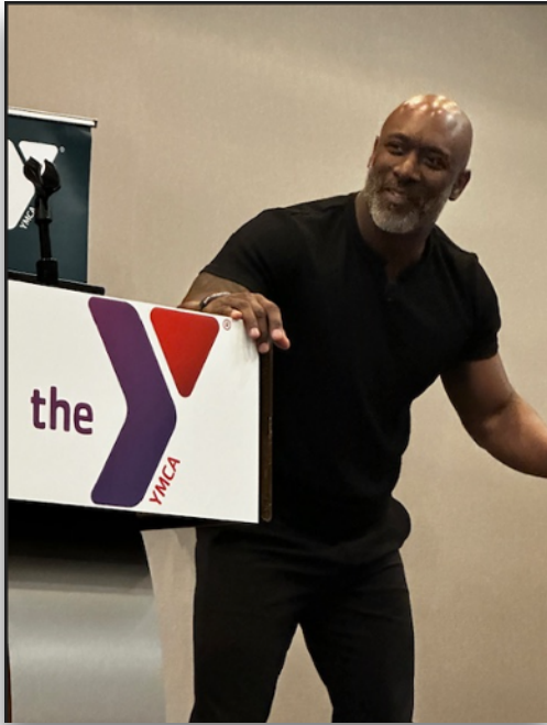
Day 1 Keynote Speaker