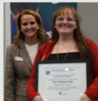
Toy Pendleton Youth Development