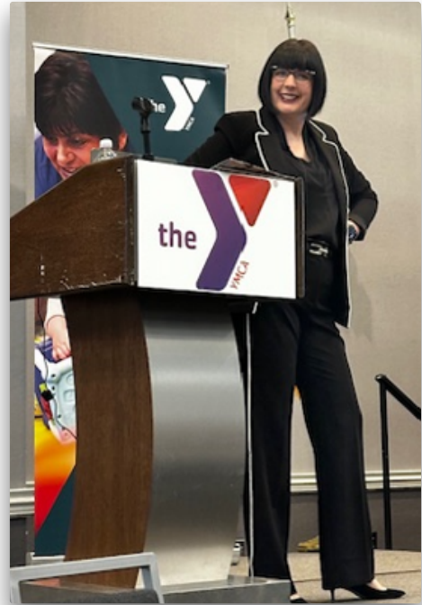
Day 2 Keynote Speaker